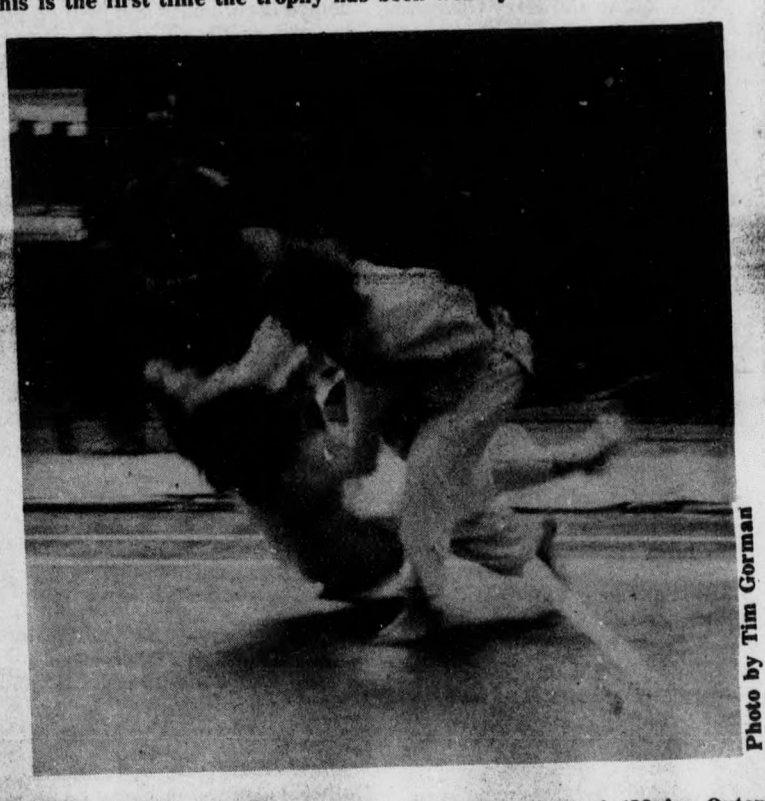
One contestant throws his opponent with O Soto Gari (Major Outer