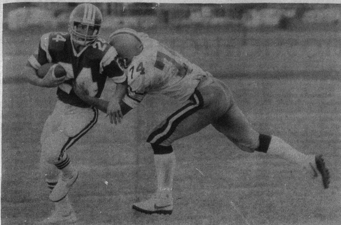
Football in Lloydminster. What next?