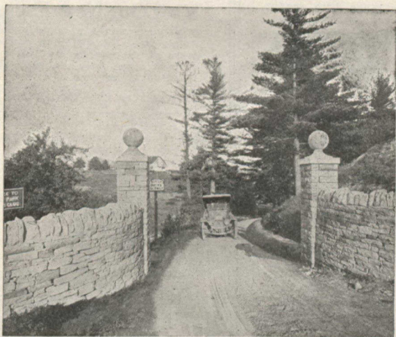
One of the Entrances to Lawrence Park.

city; as near the shops, theatres and railroad stations as are "The Hill" or "Rosedale"---Toronto's swell residential districts.