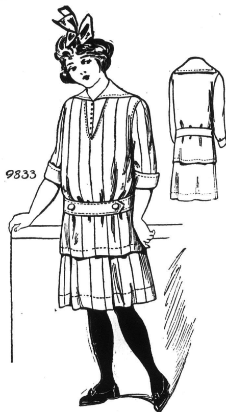
9833. A natty and comfortable dress. Girl's dress in Russian blouse style, with chemisette, and with long or shorter sleeve.

This illustration calls for two separate patterns which will be mailed to any address on receipt of 10c. for each pattern in silver or stamps.