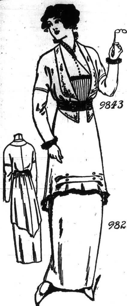
9843-9820. A Unique and Stylish Model.

posed of Ladies' Waist Pattern 9843 and Ladies' Skirt Pattern 9820. The waist is cut in six sizes: 32, 34, 36, 38 40 and 42 inches bust measure. The skirt in five sizes: 22, 24, 26, 28 and 30 inches waist measure. It requires 7\frac{1}{2} yards of 40-inch material for a 36-inch size.