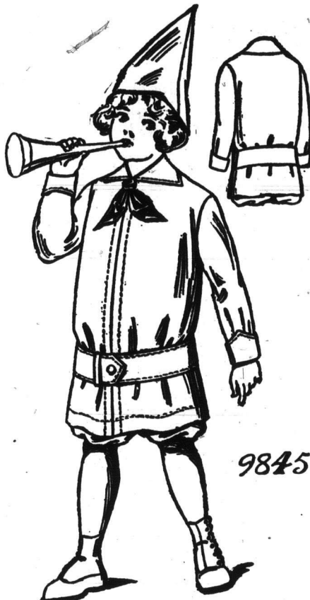
Boys' Russian Suit with Knickerbockers. 9845. A Comfortable Suit for the Little Boy.

Blue serge was used for this design, which is finished with a high neck closing. It has simple lines, a jaunty collar and cuffs, and will look equally well in flannel, galatea, madras, gingham, velvet, or corduroy. The pattern is cut in four sizes: 3, 4, 5 and 6 years. It requires 3\frac{3}{4} yards of 36-inch material for a five year size.