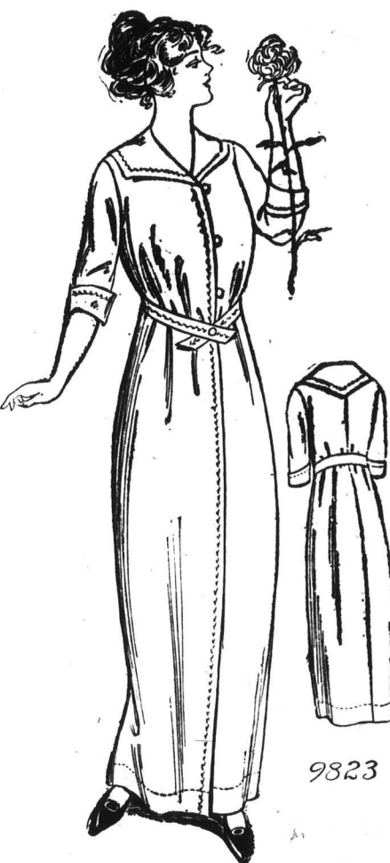
9823. A comfortable desirable model. Ladies' house gown or lounging robe.

A pattern of this illustration mailed to any address on receipt of 10c. in silver or stamps.