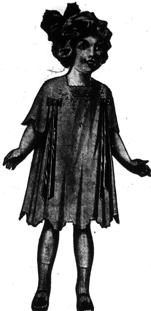
No. 1910 Dress stamped on Sheer Lawn .....65 cents Lustered Cotton to embroider .....25 cents

No. 1909 shows a dainty little dress which is stamped on Pique, and the cutting outlines are stamped on the goods so that the little dress is easily made up, this little garment may be effectively embroidered in either white or colored thread, and may be had in sizes suitable from four to six years. No. 1910 is an exquisite little dress, the design for which is stamped on sheer fine lawn and lace ruffles may be sewn underneath the scalloped edges, making this an exceedingly dainty and dressy little garment, the design is simple but effective, and the illustration shows how the finished dress may be trimmed with pretty soft ribbons. This dress may be had in sizes from two to four years. Both No. 1909 and 1910 dresses are stamped only on materials as quoted, and not made up.