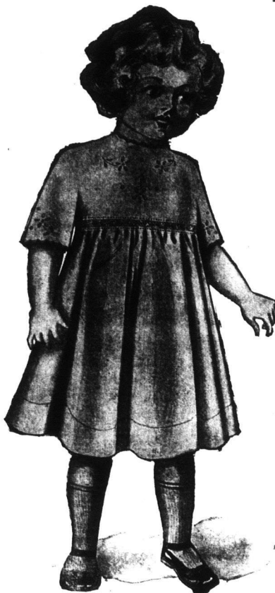
No. 22 Made up Dress, Fine Lawn .....$1.25 Cotton to Embroider .....15

A charming set of designs for embroidered baby or guest towels are pictured here, and the embroidery is carried out in outline stitch and French knot effects. The design should be worked in colored threads, but the borders may be white if preferred. It will be noted that