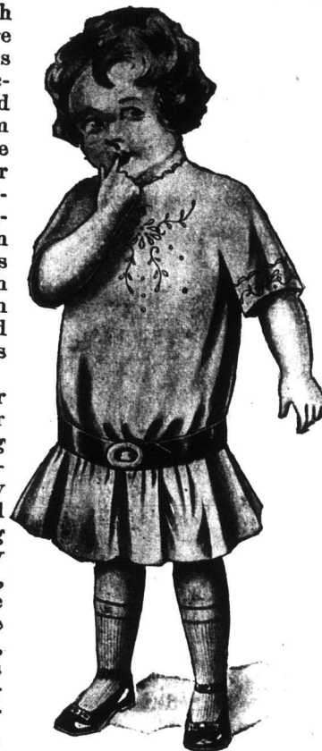
No. 23 Made Up Dress, White Pique .....60 cents