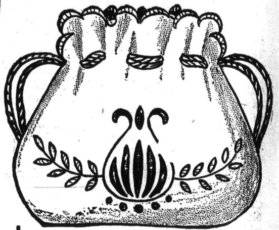
Design No. 601.