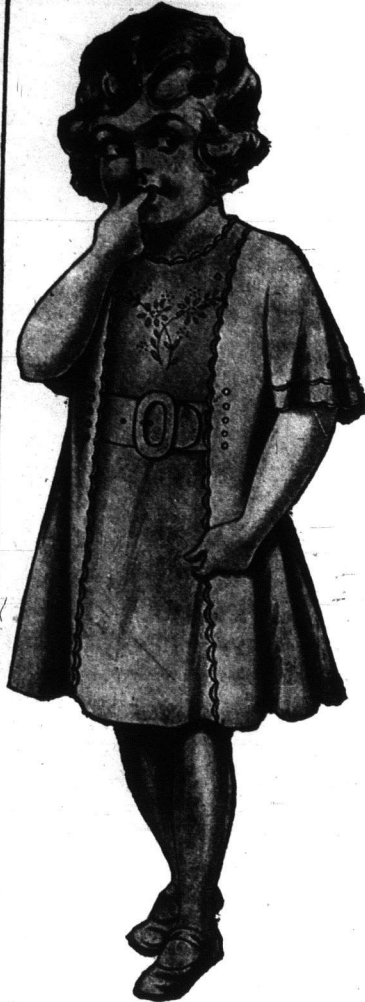
No. 1909 Dress Stamped on Corded Pique .....75 cents Lustered Cotton to Embroider .....20 cents

Our readers are always interested in dainty articles for children's wear, and we are illustrating some attractive little garments which will appeal as they are easily embroidered and made up on simple lines and, at the same time, stylish and up-to-date.