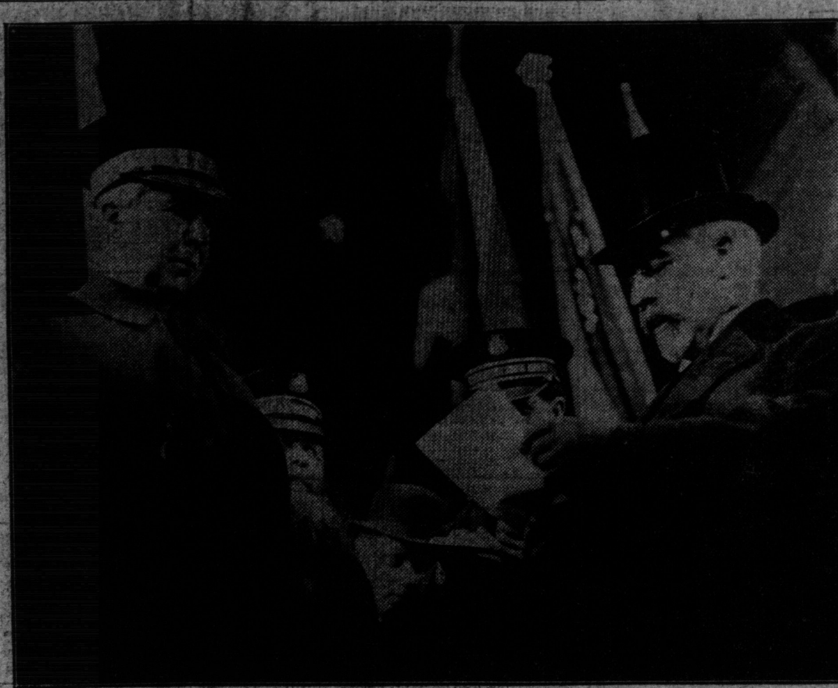
Mayor Hocken Reading an Address of Welcome to the Head of the Salvation Army on the Steps of the City Hall.