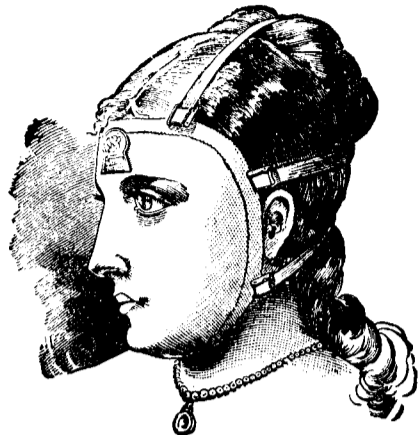
THE TOILET MASK, or Face Glove, IN POSITION TO THE FACE. To be worn Three Times in the Week.

8th. The Mask may be worn with Perfect Privacy if desired. The Closest Scrutiny cannot detect that it has been used.