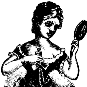
A skin of beauty is a joy forever.