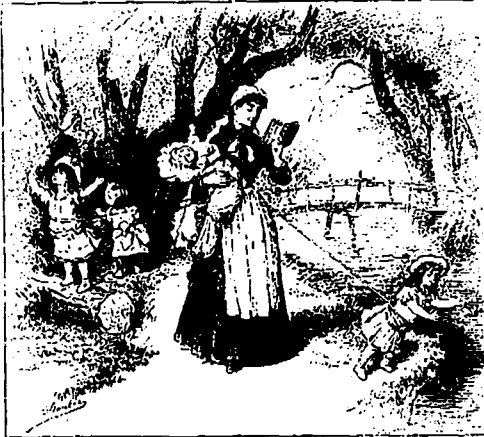
A HINT TO NURSE GIRLS WITH A LITERARY TASTE.

RUDGE & COLUMBIA BICYCLES H. P. DAVIES & CO. 22 Church St. TORONTO