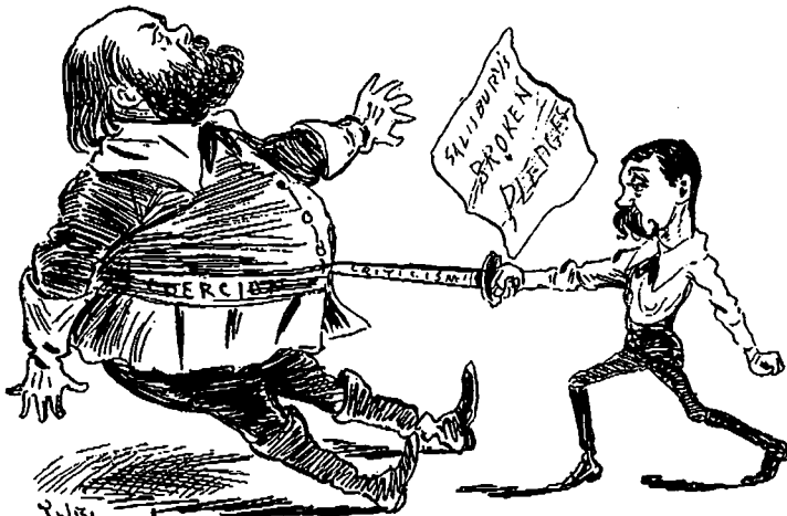
RANDOLPH, THE GIANT-KILLER.

LAWSON'S CONCENTRATED FLUID BEEF —this preparation is a real beef food, not like Liebig's and other fluid beefs, mere stimulants and meat flavors, but having all the necessary elements of the beef, viz.:—Extract fibrine and albumen, which embodies all to make a perfect food.