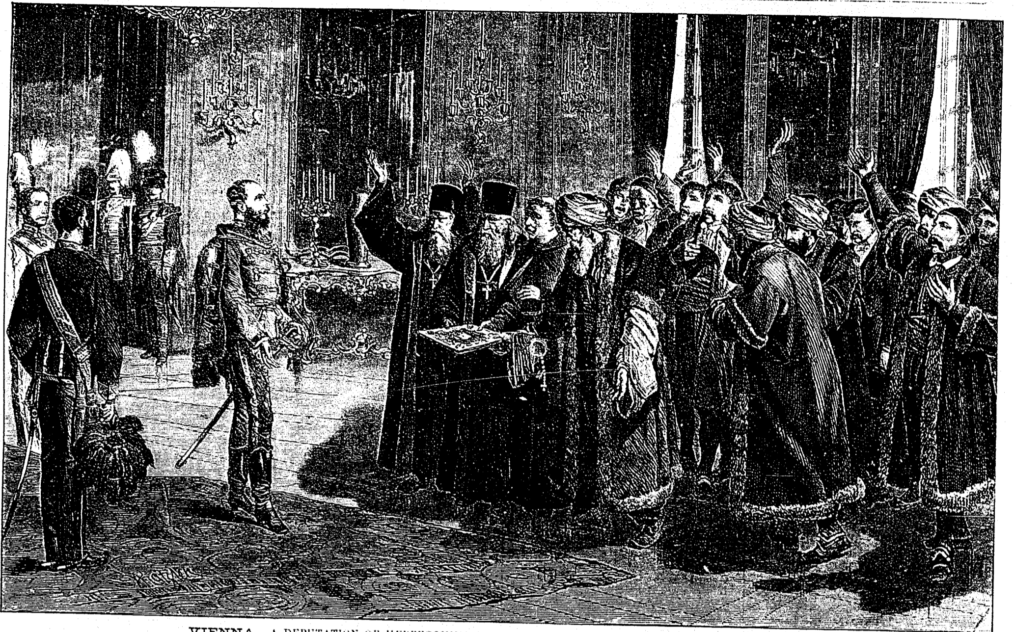
VIENNA.—A DEPUTATION OF HERZEGOVINIAN CLERGY AND NOBLES TO THE EMPEROR OF AUSTRIA.