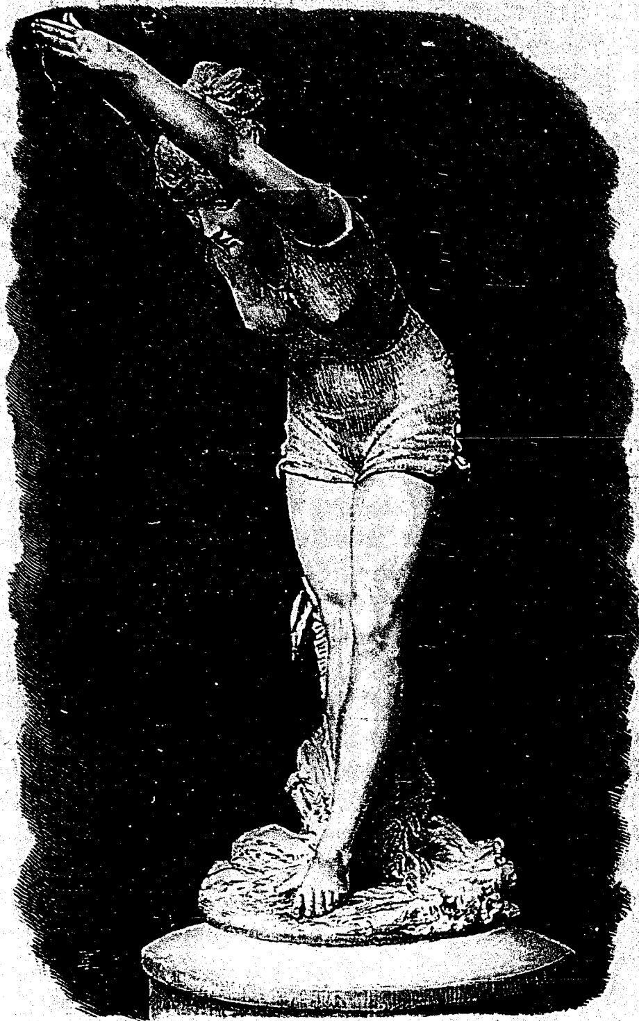
THE HEADER.—FROM THE MARBLE STATUE BY TABACCHI IN THE ITALIAN SECTION OF THE PARIS EXHIBITION.