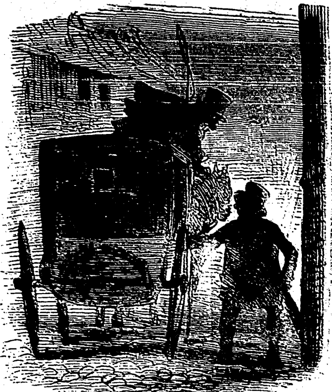
"See here! cabman, just wait a minute if you please, till I run into the house for a light; I have dropped a sovereign in the cab."