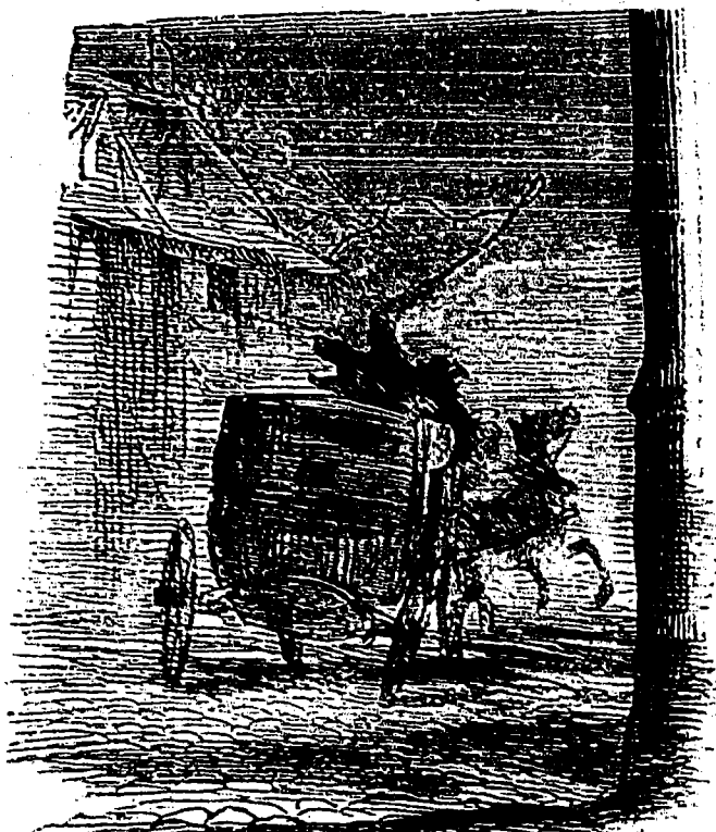
(The cabman puts whip to his horse in the darkness, not even waiting for his fare; but regrets to find, on searching the carriage, that his passenger had been entirely mistaken about the sovereign.)