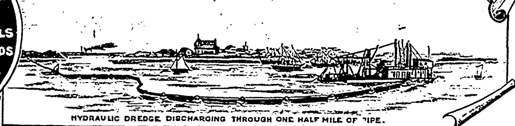
HYDRAULIC DREDGE DISCHARGING THROUGH ONE HALF MILE OF PIPE.