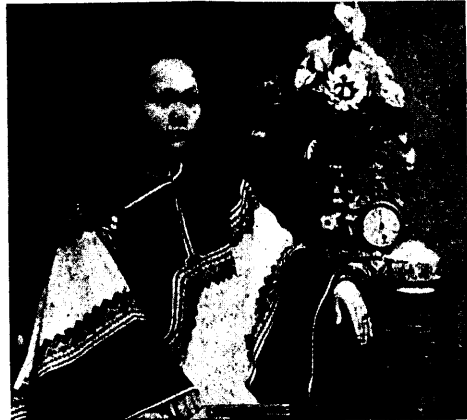
Illustrating "Through Fire and Water in China."