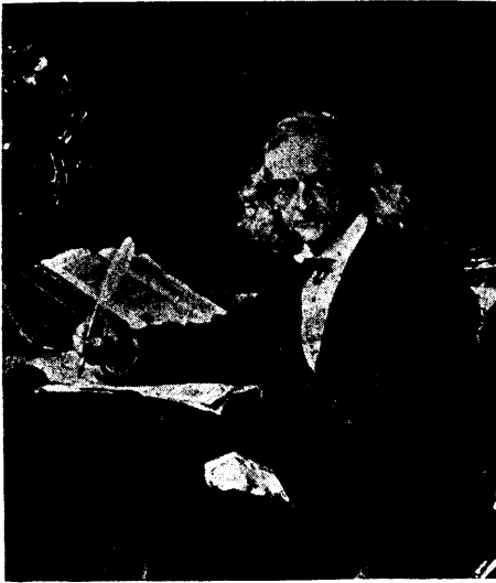
THEODOR MOMMSEN Illustrating "Great Authors."