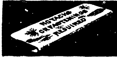
MEALEY STAIR PAD

Manufacturers of Wadded Carpet Lining and STAIR PADS Hamilton, Ont.