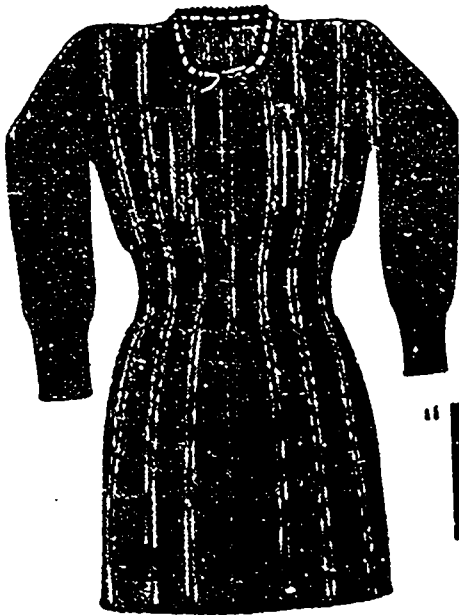
"Elystan" Nursing Vest.