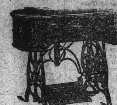
Hand Sewing Machines. Stand Sewing Machines.

$1.25 POCKET KNIVES for 75c $1.75 POCKET KNIVES for $1.25 $2.40 POCKET KNIVES for $1.50 $3.00 POCKET KNIVES for $2.00