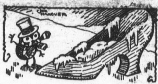
Ye Olde Village Pump.

Two classes of women do not look into the mirror often enough: Those who are too busy, and those who are too tired. In between these two classes there is a vast throng that looks but does not see. To be well dressed, one must have the sense to look, the courage to see, and the wisdom to know just what to do about it. Stores are centres of temptation, and most women who buy have spent too little time in considering. Your mirror is your best friend at such a time. It will tell you the color of your hair, eyes and skin. It will tell you if you belong to the "tail thin" or the "short fats," and whether or not you stand correctly. More than that, your mirror will tell you if you are well proportioned. It will tell you the length of your waist in relation to the body length, which is so important at the present time. When these facts have been revealed before the mirror, all the gay colors and the extreme lines in the world will not lure the wise woman to make a mistake in her selection.