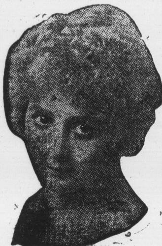
"Bessie Barrisical" in Life's Twists at Town Hall, Thursday, May 5th, along with other first class pictures by the Liberty Theatres.