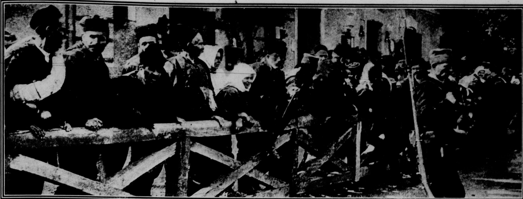
THE RIGHTS OF LITTLE NATIONS IN A CONFLICT OF GREAT POWERS: ILLUSTRATED BY SERBIAN RESERVISTS. "Here was a demand made upon Serbia by a great military power who could put five or six men in the field for every one she could, and that power supported by the greatest military power in the world. How did Serbia behave? It is not what happens to you in life that matters, it is the way you face it. And Serbia faced the situation with dignity." (Speech by David Lloyd George.)