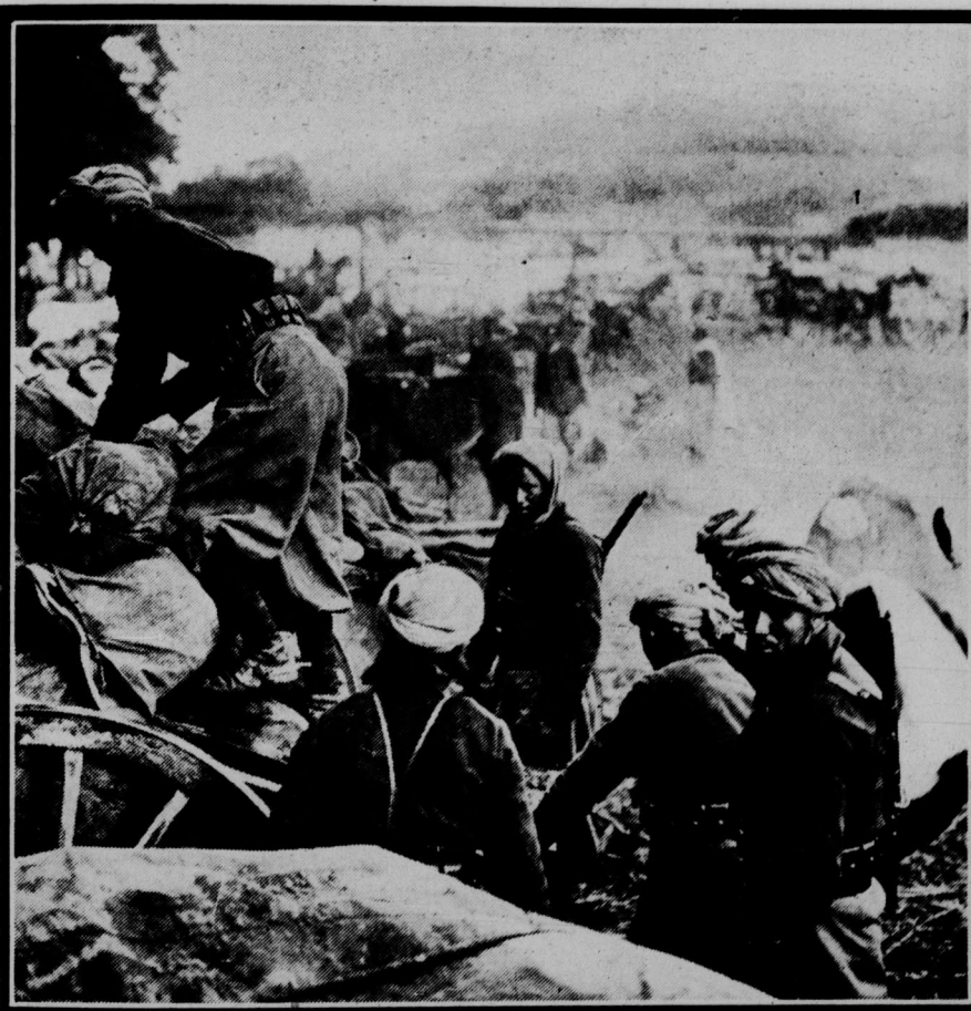
The gallant conduct of the French Algerian soldiers in the war has already been the subject of special mention from the front. This picture shows a convoy under care of these troops at Frane-le-Port. Note good-humored faces.