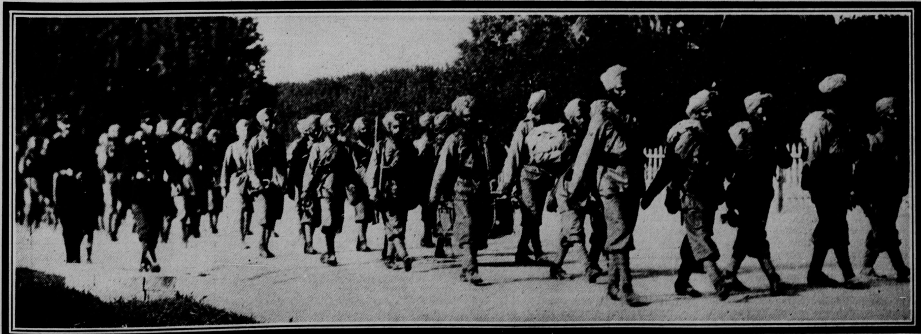
Note the contrast between the northern French countryside and the dark-skinned gentlemen-fighters from India, swinging along the road towards the firing line. The censor forbade publishing the exact whereabouts the picture was taken. The troops have been rapidly acclimatized in France, and have played an important part in several engagements.