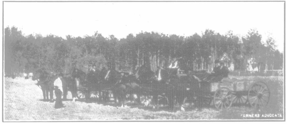
GENERAL PURPOSE TEAMS AT WOODLANDS SHOW

flour, owing to the depreciation of ods of farming in that section, it has salaries; officers, clerks, etc., on salaries; silver and of the increased production issued two bulletins giving publicity operatives or workers classed as over of the Shanghai and Manchurian mills, to such facts and figures as have direct and under 16 years on wages, and piecebearing on the subject, although it is workers employed outside of the works.