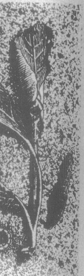
Characteristic Work of the Cut Worm.

does not know the ordinary or more correctly speaking, beetle. It comes thumping into the room during the evening the lamps are lighted and the windows are open. Any who are well acquainted with the insect are not aware that it is the same as the white grub more advanced stage. These or "June bugs" have a life span covers a period of about 100 days. First we have the eggs, then the small white grubs, which go down into the soil where they may remain for a number of years. During their second