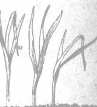
Grub at Work on Plant Roots.

we have the cabbage worm most destructive in the garden. It does its bad work all the time so we can poison it when the heads of cabbage in the garden. There will be dozens of species of insects and a study of them will reveal many of the mysteries of