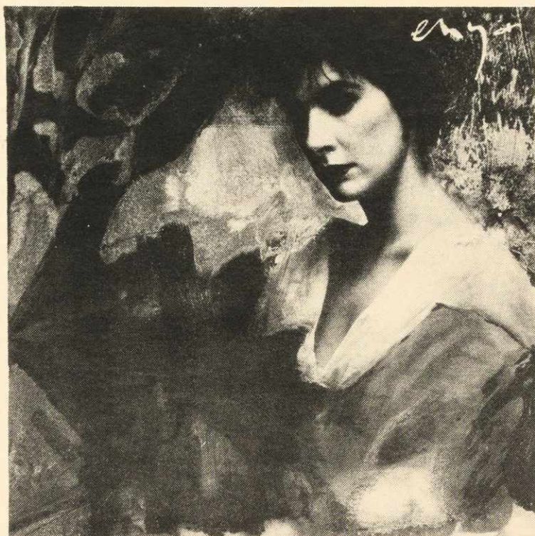
Enya's solo album, Watermark , features the song "Orinoco Flow (Sail Away)" which went to #1 in the U.K.

Former Clannad member Enya offers something extraordinary on her debut album, Watermark (WEA). Using layers upon layers of her vocals (sometimes overdubbing notes up to 120 times) and limiting instruments to keyboards only, she has produced a soothing swirl of sound that can only be called beautiful. Though she sings in Irish, the effects are not unlike those created by the Cocteau Twins, another band whose vocalist evokes emotion with each song