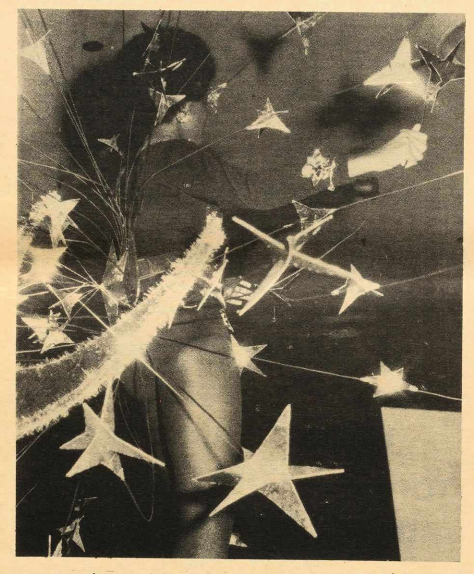
A scene from last year's successful "Caribanza".