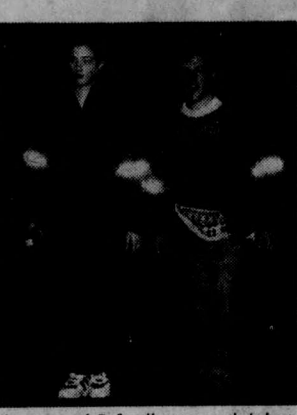
A new co-ed Safewalk team on their beat.