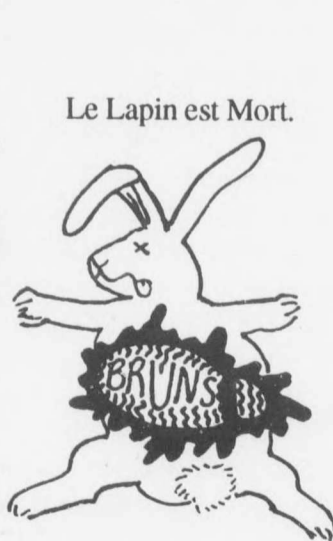
Le Lapin est Mort.