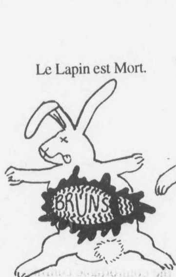
Le Lapin est Mort.