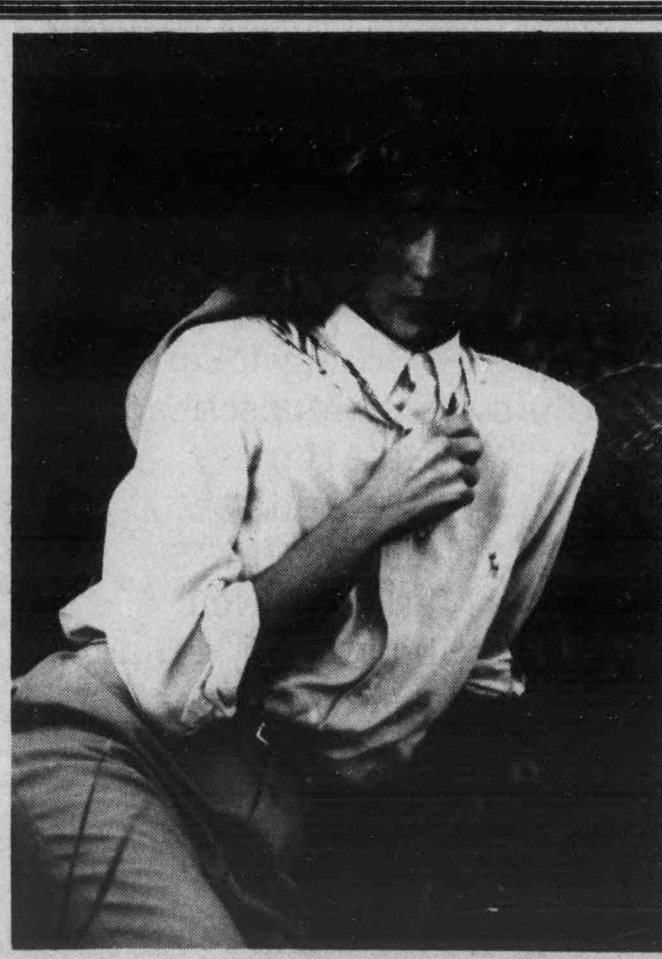
No one suits tradition quite like Ralph Lauren...