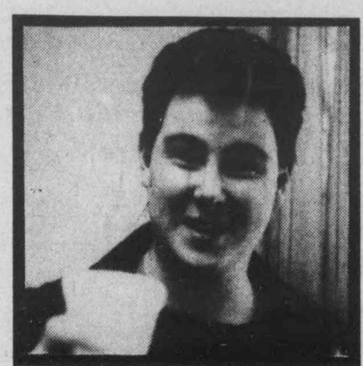
EE IV Iain "What did the engineering grad say to the arts grad?" -I'll have a burger and fries please!