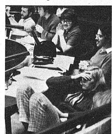
OH MY GAWD! . . . council was exciting

travel expenses, the political union has only cost for travel expenses to the meetings.