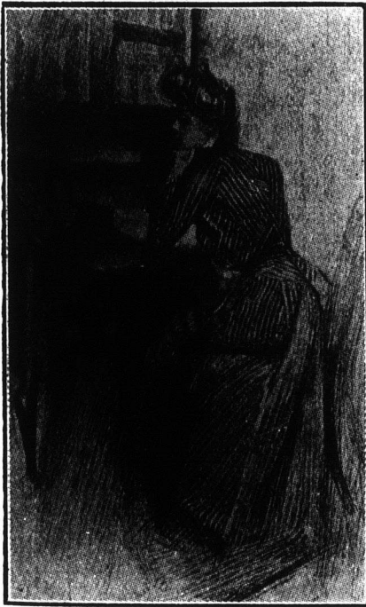
"TOOK UP A SHEET OF BLUE PAPER."