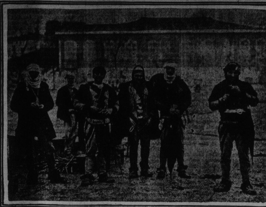
GROUP OF ALBANIANS NEAR THE CUSTOMS HOUSE AT AVLONA. THIS OPEN SPACE, WHICH IS NOW BUSY WITH ITALIAN SOLDIERS, CONTAINS A TYPICAL GROUP OF ALBANIANS, VERY PICTURESQUE FELLOWS, WITH EMBROIDERY SWEEPING DOWN THE SIDE OF THEIR TROUSERS AND DECORATING THEIR TUNICS. THE HEAD AND CHIN ARE SWATHED IN ARAB FASHION. THE UMBRELLA IS VERY POPULAR IN ALBANIA, OWING TO THE HEAVY RAINFALL.