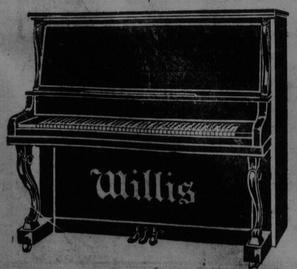
ONE OF THE WILLIS PIANOS.