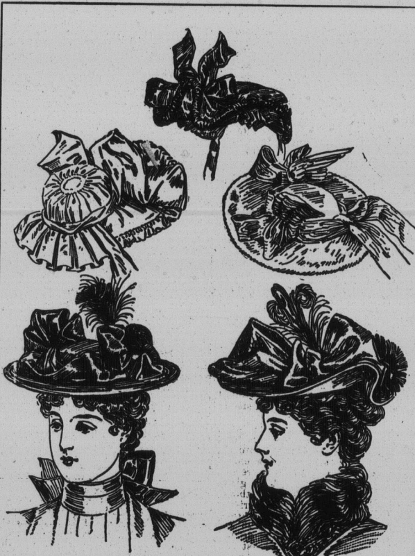
HATS FOR THE COMING WOMAN.

There are people who make it sort of a rule of their lives, to examine every article in the fancy shops, at Christmas, and they have an unpleasant habit of committing the prices to memory, and pouring out whole volumes of undesirable information on the subject. They will tell you of the lovely things they saw at one shop, the delightful novelties that are to be had at another, and the wonderful