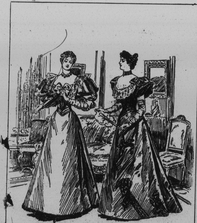
DINNER OR DANCING GOWNS.

reality, since the value of a gift does not depend on the price that is paid for it, but still there is an uncomfortable feeling about it. And that is another serious drawback to buying one's present in the very bosom of one's family, as it were; everyone knows so exactly what everything costs that the price of a present might almost as well be written on the back. We are all looking for some suitable presents, at the same time; we make a tour of the shops and unfortunately everything is likely to be marked so plainly with the price, that even when you do not buy, you can scarcely help knowing what it costs, and even if the price mark is private there is sure to be a polite clerk at hand to translate it for you; so like love, and a cough, it cannot be concealed. It really is very annoying to see some pretty thing which looks as if it cost a dollar and a half at least, and present it to someone with quite a grand