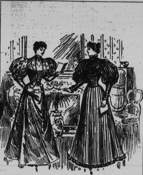
TWO HANDSOME HOUSE GOWNS.

I think if I could afford it that I would flee away, not to the uttermost ends of the earth exactly, but to some far distant city, at Christmas time, and purchase the few souvenirs I intended giving my friends, as far away from the said friends as possible. and goes home feeling almost as proud as you felt yourself. On Christmas morning you each present the other with the same thing, and worst of all each knows exactly what the gift cost. Not that it makes the least difference in