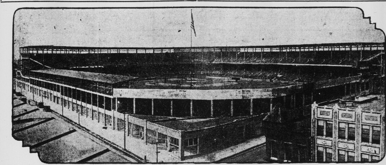
HERE is an aerial view of famous Sportsman's park, St. Louis, where the Cardinals played host to the Yankees yesterday. It was enlarged several months ago and is an up-to-date baseball plant in all respects. The teams play here today as well.