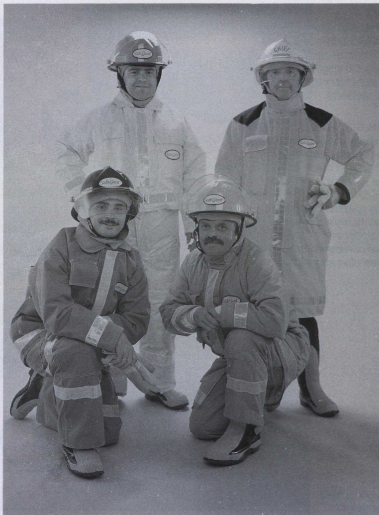
Protective clothing for fire-fighting personnel

Furthermore, Securitex produces accessories such as gloves, balaclavas and hoods. To complement its product line, the company supplies a self-contained breathing apparatus, helmets, personal alert safety systems, aluminized garments and other suits.