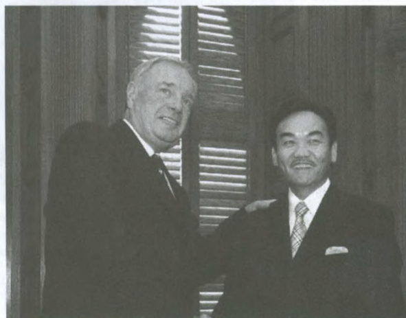
Prime Minister Paul Martin and Mongolian President Natsagiin Bagabandi met in Ottawa in late October. The leaders reaffirmed their shared commitment to enhance bilateral relations.

continued on page 2 — Mongolian consulate opens