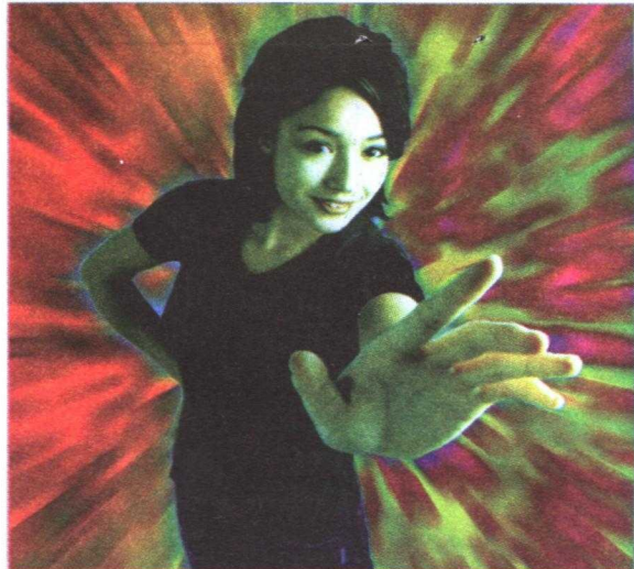
Official poster of Asia Connects Youth Conference

Delegates had packed their bags and were ready to go, but the Red River flood forced organizers to postpone Asia Connects from its original date in May to September 28 – October 5. Canadian and Asian youth are set to meet in late September to discuss their shared