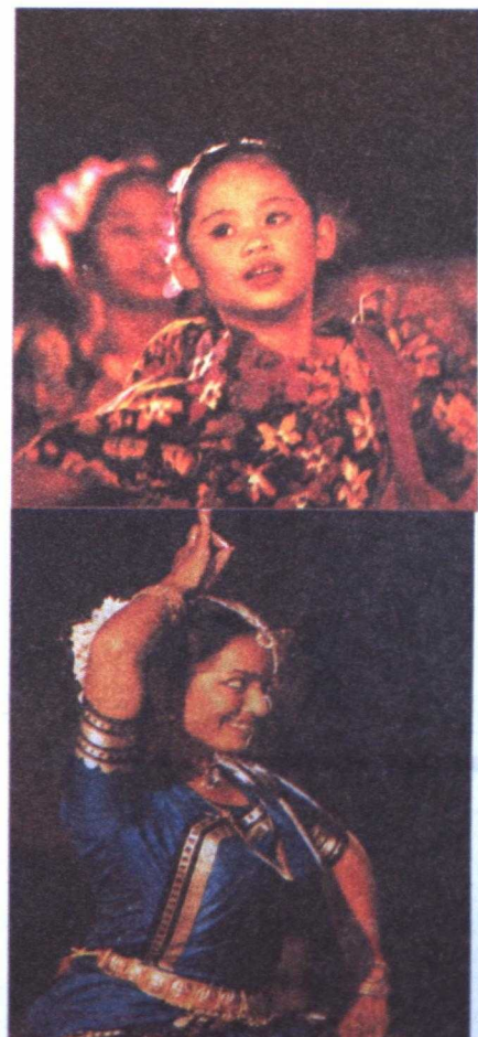
Folklorama hosts a wide variety of Asian performers each year

For more information, contact the Folklorama Festival at 1-800-665-0234.