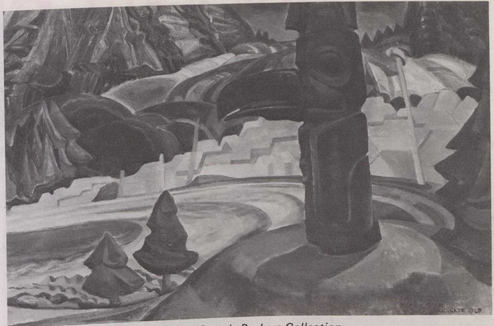
Skidegate by Emily Carr is part of Canada Packers Collection.

One of the most important paintings in the collection, Emily Carr's Skidegate , 1928, along with Lawren Harris's c. 1922