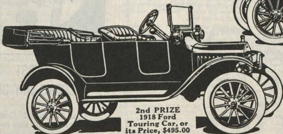
2nd PRIZE 1918 Ford Touring Car, or its Price, $495.00