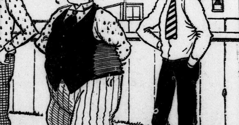
THE PASSING AIRPLANE

IF IT WAS A HOT AIR BALLOON, YOU KEPT IT INFLATED! WHY SAY MAJOR - YOU COULDN'T GO UP A FIFTEEN FOOT LADDER WITHOUT GETTING DIZZIER THAN AN EGG BEATER!