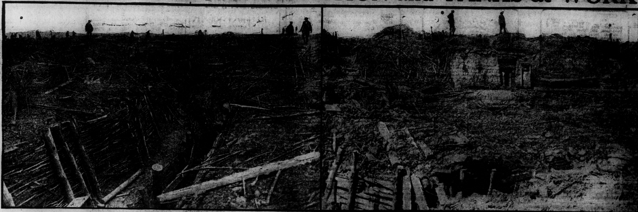
The great Battle of Messines Ridge.—Boche trenches.