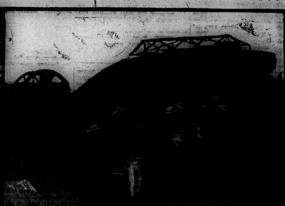
On the British Western Front in France.—Tanks' attack on Thiéval.