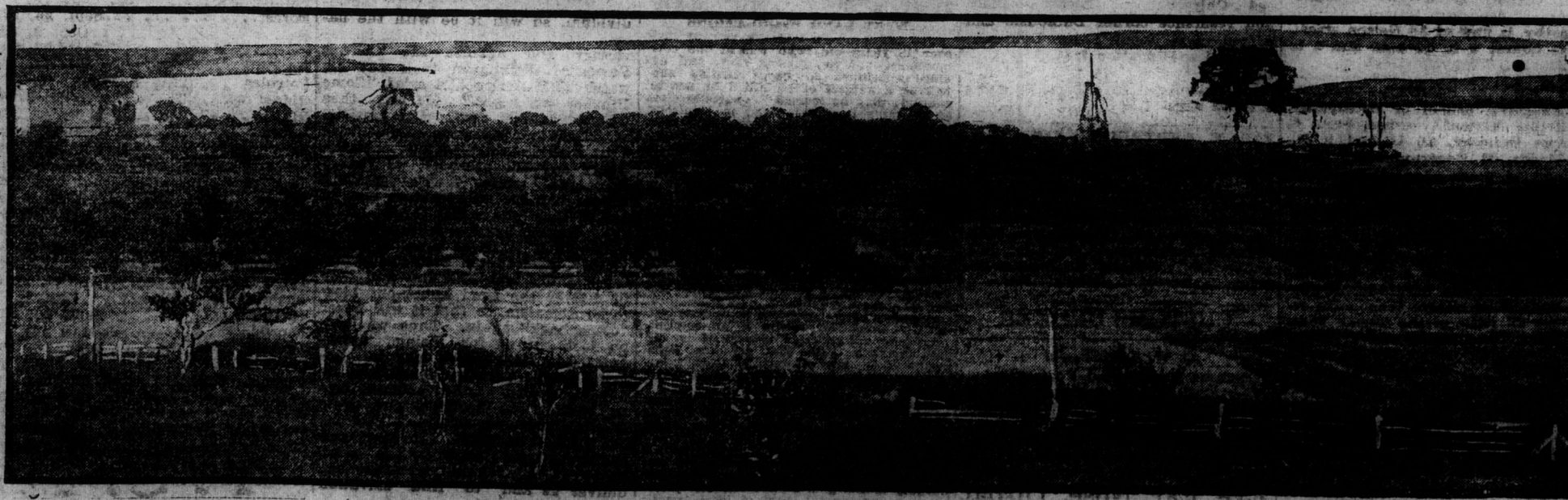
An Apple Orchard in Evangeline's Land, Nova Scotia.

A motor trip through Nova Scotia is an ideal September holiday. The little towns nestle into their orchards like a violet under its leaves; the sparkling basin is an infinitely extended, sun-warmed bathing beach; all the farm-houses are painted white, and, as there are no factories, they stay that way, looking like stage scenery against the vivid green country. And finally, there is all the game and fishing you'd want in the rough country over South Mountain, where the hunting camps lure their September guests with a promise of moose.