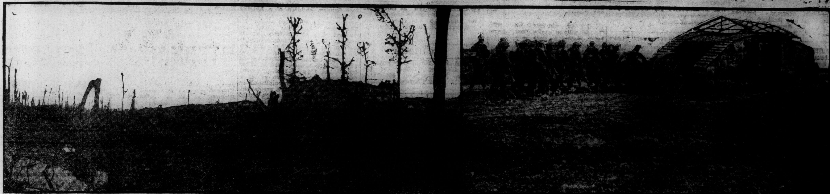
The great Battle of Messines Ridge.—Smashed Boche fortress and trenches.