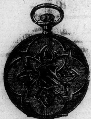
On Exhibition at BULLER BROS. and NEW- MAN AND SONS' Jewelry Stores.