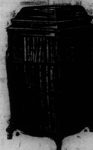
On Exhibition at CHAS. BROWN'S and T. J. BARTON AND SON'S Music Stores.

THE GOOD MORN- ING SMILE THAT WE LIKE TO SEE ON EVERY CANDI- DATE'S FACE, AND THE ONLY SMILE THAT WILL HELP YOU WIN IN THIS RACE.