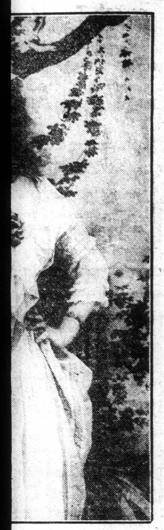
LE IN "SHE STOOPS TO

and strain, draws out the ases the pain. The peneics of Nerviline enable o the very core of the you experience a feeling