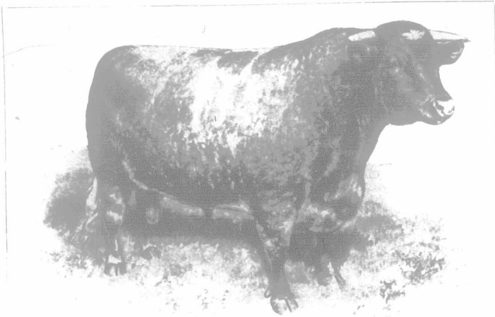
IMP. SPICY MARQUIS (80032) = 36118 =.