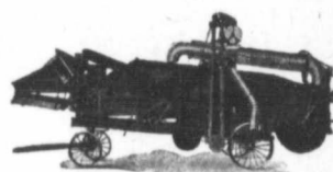
The 32 x 52