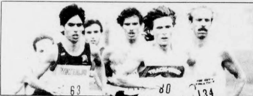
YORK RUNNERS fared well at last Saturday's Cross-Country Open.

"I don't want to make excuses. I was not able to train as much as I would have liked to this summer; but