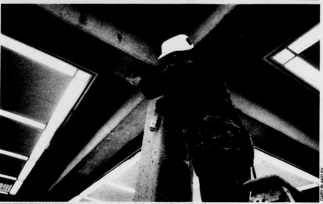
WINTER RENOVATIONS: While most York folk are busily bustling from class to class, this lone renovator cleans the beams on 5th floor, Ross Building. See page 5 for more pictures.

OFS—OFS is a democratic organization and therefore, according to