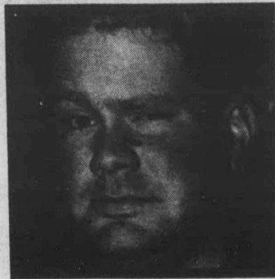
The Captain BBA V "Over qualification"