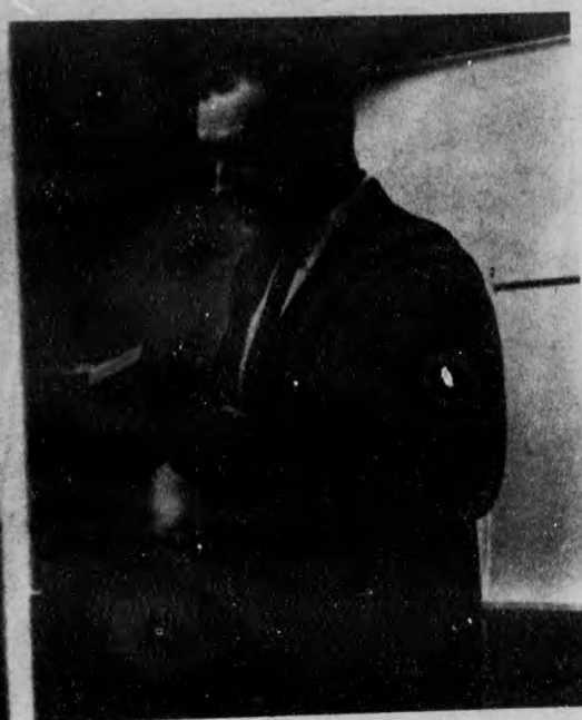
"Putting a bar on a university campus would be just as bad as opening a brothel or a casino." -- Berry

"At the wedding feast of Cana, Jesus produced . . about 1000 quarts of