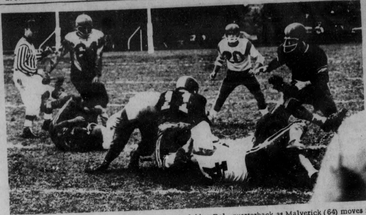
Action on kickoff return--Kirk and O'Neil of UNB clobber Dal, quarterback as Malverick (64) moves in and Palov (20) awaits results